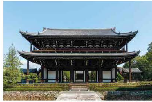
Sanmon (Main Gate, National Treasure)