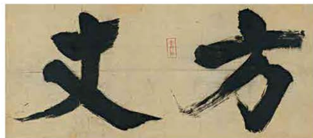
National Treasure Calligraphy Templates for Zen Temple Plaques and Notice Boards By Zhang Jizhi (1186–1266) Hanging scroll; ink on paper Tōfuku-ji Temple, Kyoto, November 14–December 3, 2023