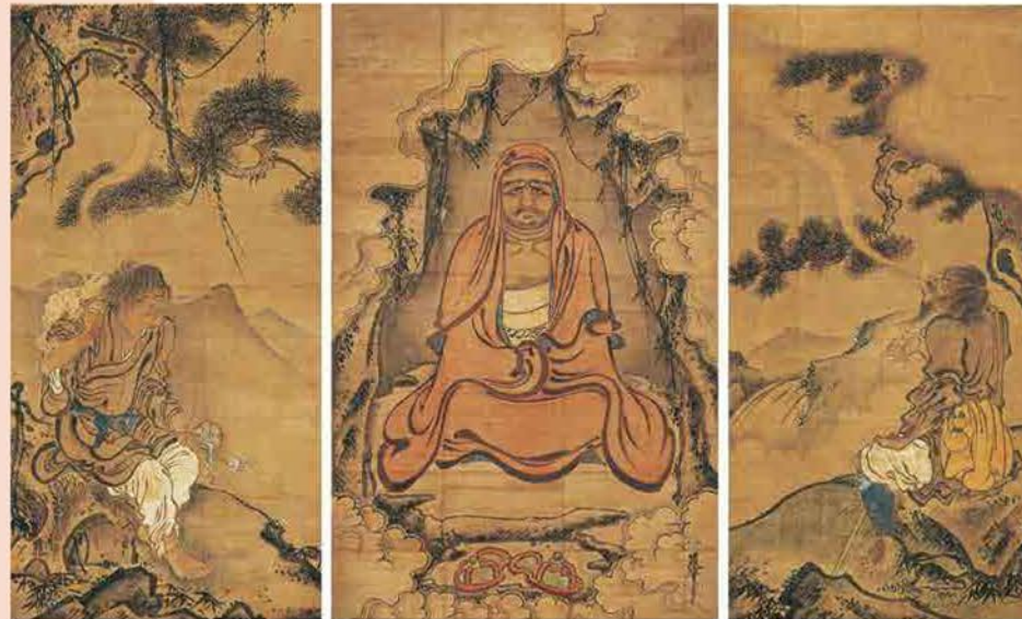
Important Cultural Property Bodhidharma, Liu Haichen, and Li Tieguai By Kissan Minchō (1352–1431) Three hanging scrolls; ink and colors on paper Tōfuku-ji Temple, Kyoto, November 7–December 3, 2023