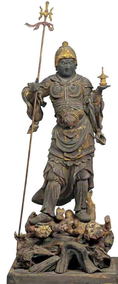
Standing Tamonten (Vaiśravaṇa) from Four Heavenly Kings Wood with lacquer, gold foil, and pigments, rock crystal eyes ( gyokugan ) Tōfuku-ji Temple, Kyoto