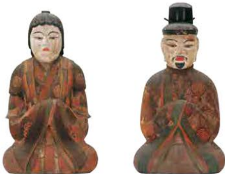
Important Cultural Property Male and Female Deities (Seated Amenooshihonomimi no Mikoto and Takuhatachihime no Mikoto) Wood with pigments Izumi Anashi Shrine, Osaka

January 2–February 25, 2024, Heisei Chishinkan Wing, Gallery 1F-1