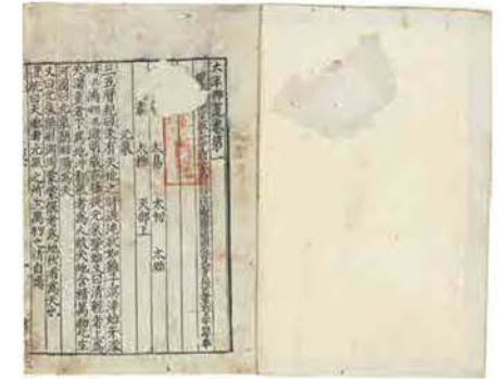
National Treasure Imperial Readings of the Taiping Era (Ch: Taiping yulan) Book; woodblock-printed ink on paper Tōfuku-ji Temple, Kyoto, this book on view October 7–November 5, 2023