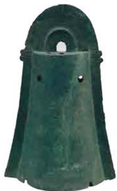
Important Art Object Dōtaku Ritual Bell with Flowing Water Design Bronze Kyoto National Museum

January 2–February 4, 2024, Heisei Chishinkan Wing, Gallery 1F-2