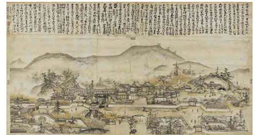
Important Cultural Property Tōfuku-ji Temple Precincts Inscription by Ryōan Keigo (1425–1514) Hanging scroll; ink and light colors on paper Tōfuku-ji Temple, Kyoto, on view November 7–December 3, 2023