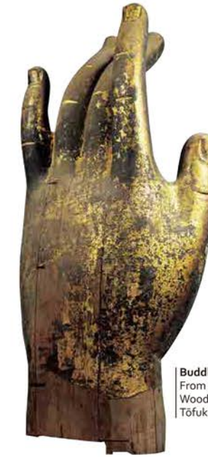
Buddha's Hand From the former principal image of Tōfuku-ji Temple Wood with lacquer and gold foil Tōfuku-ji Temple, Kyoto