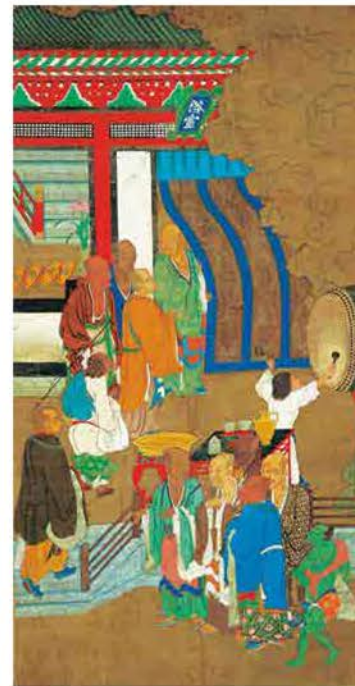
Important Cultural Property The Five Hundred Arhats, No. 40 By Kissan Minchō (1352–1431) Hanging scroll; ink and colors on silk Tōfuku-ji Temple, Kyoto No. 40 on view November 21–December 3, 2023