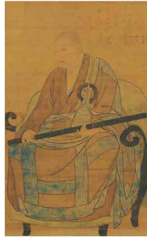
Important Cultural Property Enni Inscription by Enni (1202–1280) Hanging scroll; ink and colors on silk Manju-ji Temple, Kyoto, on view November 7–December 3, 2023