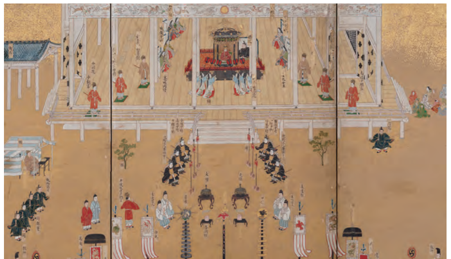
Enthronement of Emperor Reigen By Kano Einō (1631–1697) Kyoto National Museum. Detail.