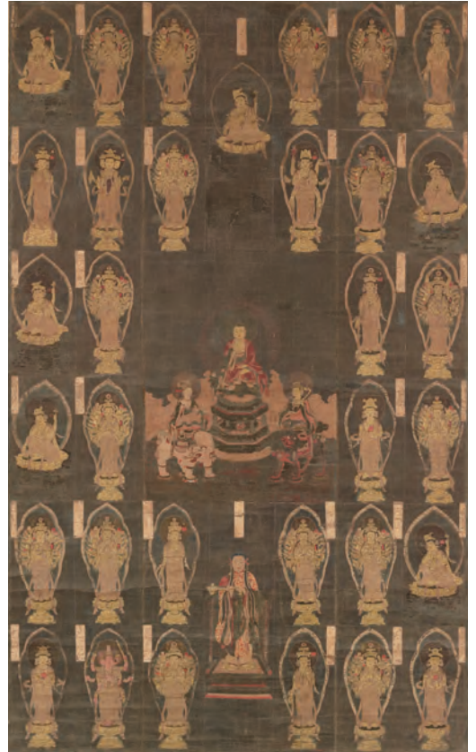
Mandala of the Images of Kannon from the Thirty-three Pilgrimage Sites. Kannonshō-ji Temple, Shiga. (On view July 23–August 16, 2020.)