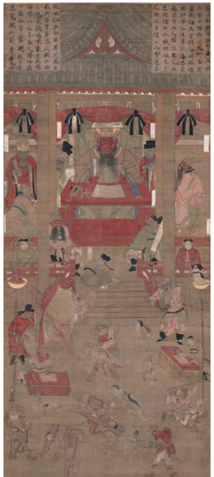
Rokudō-e (Six Realms of Rebirth) Shōju Raigō-ji Temple, Shiga. National Treasure. (On view August 18–September 13, 2020.)