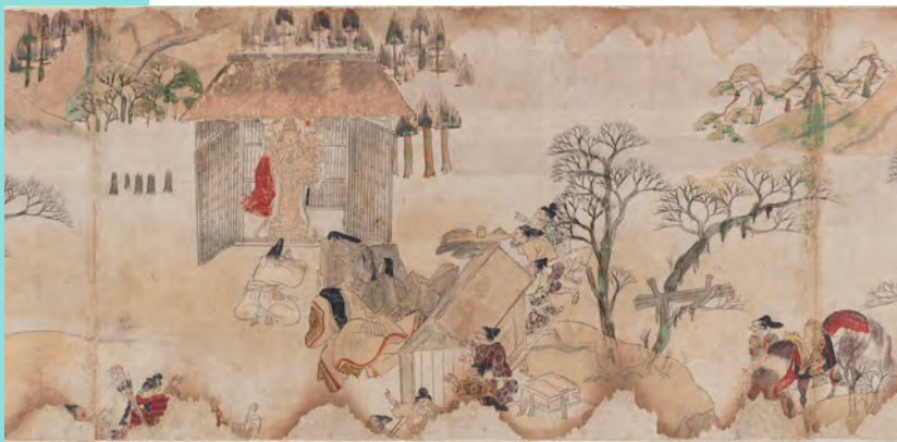
Kokawadera engi emaki (Illustrated Legends of Kokawa-dera Temple). Kokawa-dera Temple, Wakayama. National Treasure. Detail. (On view July 23–August 16, 2020.)