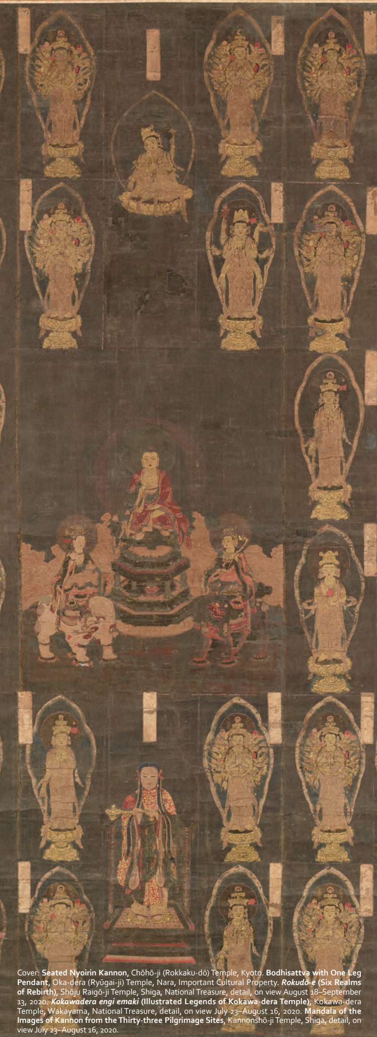
Cover: Seated Nyoirin Kannon, Chōhō-ji (Rokkaku-dō) Temple, Kyoto. Bodhisattva with One Leg Pendant, Oka-dera (Ryūgai-ji) Temple, Nara, Important Cultural Property. Rokudō-e (Six Realms of Rebirth), Shōjū Raigō-ji Temple, Shiga, National Treasure, detail, on view August 18–September 13, 2020. Kokawadera engi emaki (Illustrated Legends of Kokawa-dera Temple), Kokawa-dera Temple, Wakayama, National Treasure, detail, on view July 23–August 16, 2020. Mandala of the Images of Kannon from the Thirty-three Pilgrimage Sites, Kannonshō-ji Temple, Shiga, detail, on view July 23–August 16, 2020.