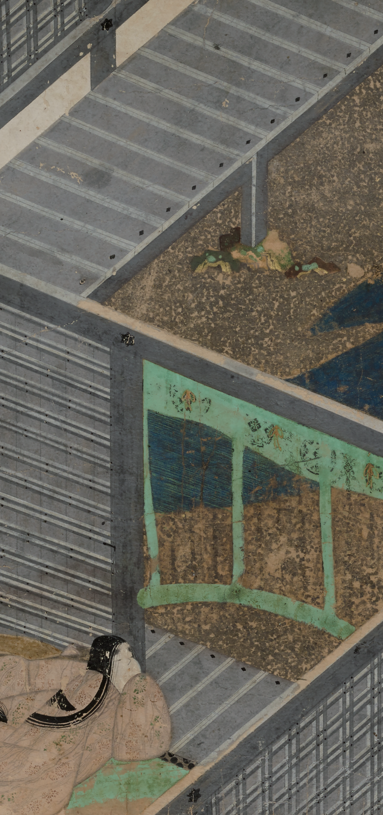
Important Cultural Property Illustrated Tales of Ise , detail Kuboso Memorial Museum of Arts, Izumi, Osaka On view November 12–24, 2019