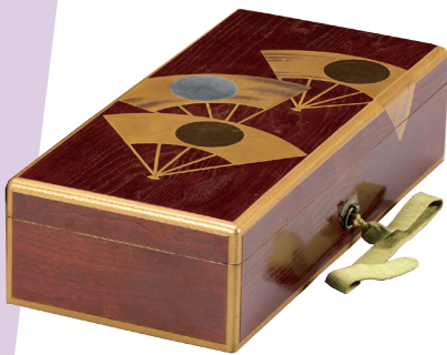
Box full moon and fan crest and other original storage boxes for the scrolls of The Thirty-six Immortal Poets, Satake version Lacquered wood with makie (sprinkled metallic powder) decoration; wood