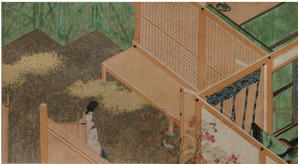
Important Cultural Property Illustrated Tales of Ise, detail Kuboso Memorial Museum of Arts, Izumi, Osaka [on view November 12–24, 2019]