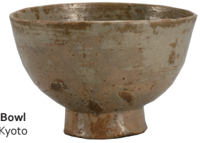
Momiji Goki-type Tea Bowl Nomura Art Museum, Kyoto