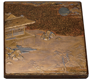
Inkstone Case with Poetic Scene of Sumiyoshi Wood with lacquer and makie (sprinkled metallic powder) decoration Gift of Okumura Jūbei, Kyoto National Museum