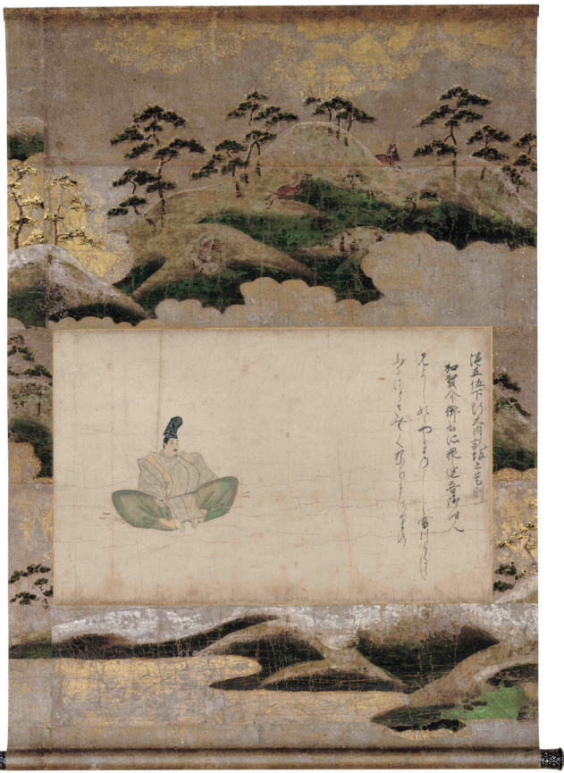
Important Cultural Property Sakanoue no Korenori from The Thirty-Six Immortal Poets, Satake Version Attributed to Fujiwara no Nobuzane (1176–1265) Inscription attributed to Gokyōgoku Yoshitsune (1169–1206) Agency for Cultural Affairs