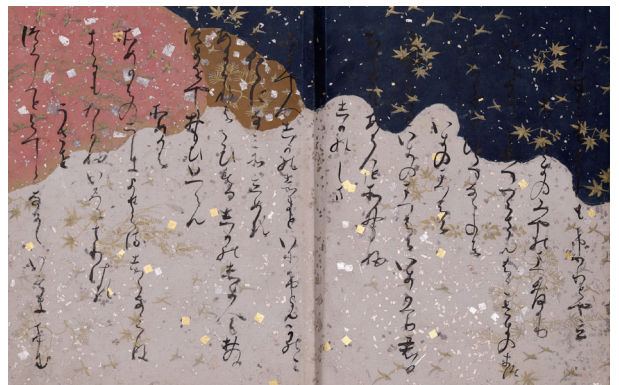
National Treasure "Shigeyuki shū" (Collected Poetry of Minamoto no Shigeyuki) from Sanjūroku nin kashū , detail (Anthology of Poems by the Thirty-six Immortal Poets) Hongan-ji Temple, Kyoto *This section of the Album on view are subject to change without notice.