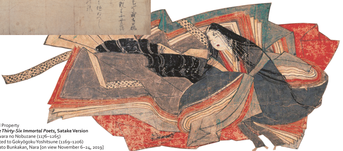
Important Cultural Property Koōgimi from The Thirty-Six Immortal Poets, Satake Version Attributed to Fujiwara no Nobuzane (1176–1265) Inscription attributed to Gokyōgoku Yoshitsune (1169–1206) The Museum Yamato Bunkakan, Nara [on view November 6–24, 2019]