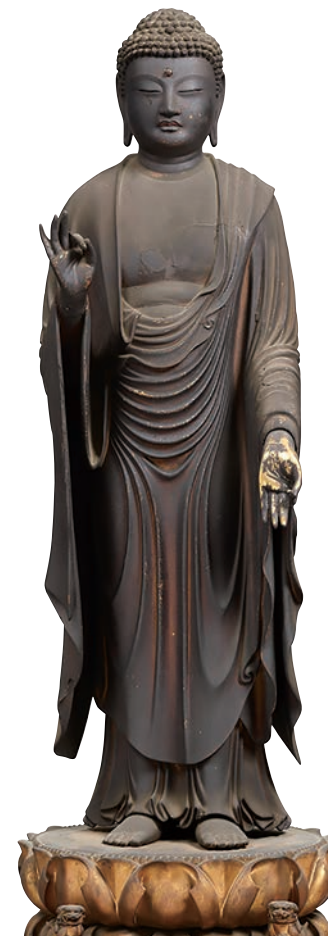
Standing Amida (Amitābha) Buddha By Gyōkai (dates unknown) Monmyō-ji Temple, Kyoto