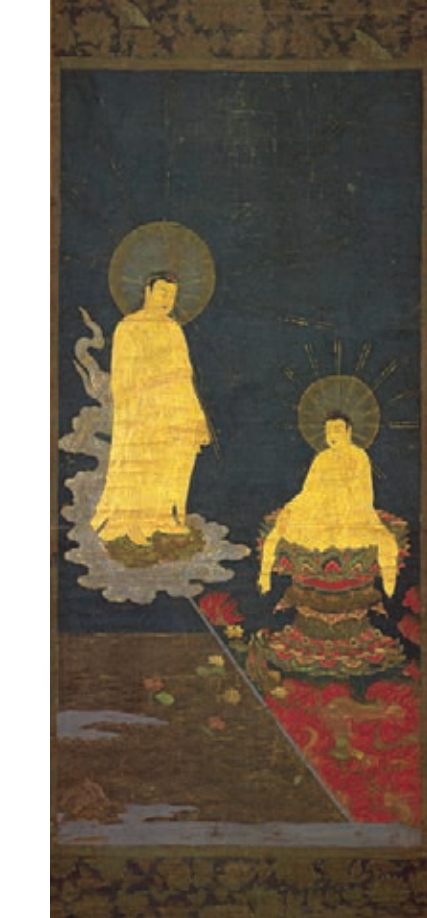
Important Cultural Property White Path between Two Rivers Manpuku-ji Temple, Shimane [on view April 13–May 12, 2019; ]