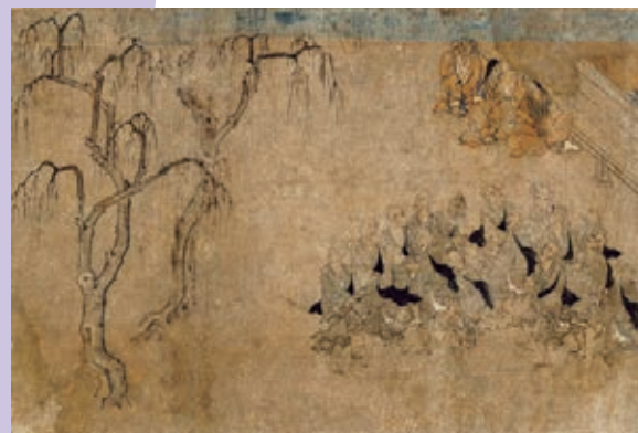
Illustrated Legends of the Venerable Itinerant Priests ( Yugyō Shōnin engi-e ), Fragment Yamato Bunkakan, Nara [on view April 13–May 12, 2019]