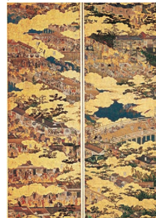
National Treasure Scenes in and around the Capital ( Rakuchū rakugai-zu ), Funaki Edition, right screen, detail By Iwasa Matabei (1578–1650) Tokyo National Museum [on view May 28–June 9, 2019]