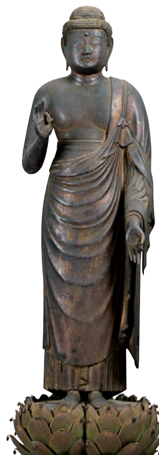
Important Cultural Property Standing Amida (Amitābha) Buddha Chion-in Temple, Kyoto