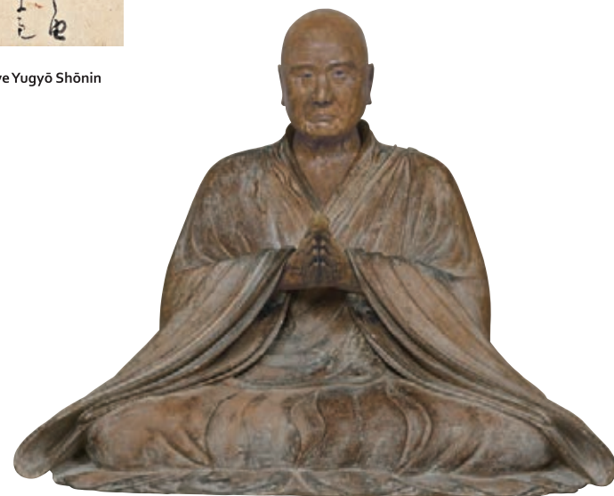
Important Cultural Property Seated Priest Shinkyō Rendai-ji Temple, Kanagawa