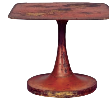
Offering Stand Wood with red lacquer Kyoto National Museum