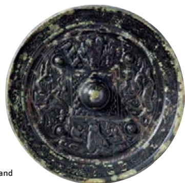
TLV Mirror with Clouds, Deities, Figures, and Mythical Beasts Cast bronze Kyoto National Museum