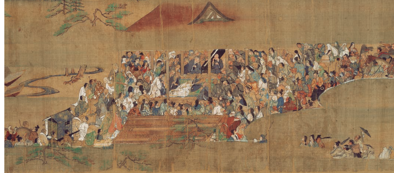
National Treasure Illustrated Biography of the Priest Ippen ( Ippen hijiri-e ), Vol. 12, detail By En'i (dates unknown) Shōjōkō-ji Temple (Yugyō-ji), Kanagawa [this section of the handscroll on view from May 14–June 9, 2019]