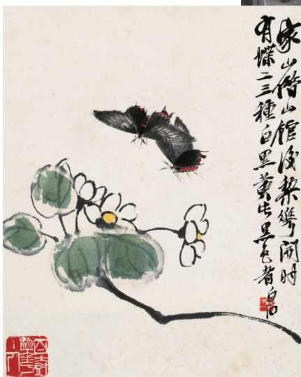
Album of Insects in Gongbi Style (Painting 1: Flowers and Swallowtail Moths), by Qi Baishi Beijing Fine Art Academy, China