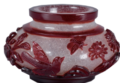
Small Jar with Flowers; Qianlong Reign Mark Gift of Matsui Hirotsugu, Kyoto National Museum