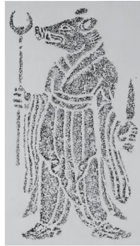
Boar, from Rubbings of the Twelve Zodiac Animals on Stones around the Tomb of Gim Yusin Kyoto National Museum