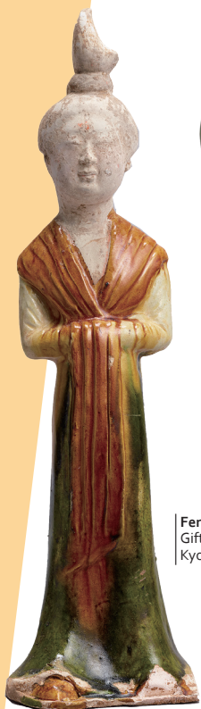
Female Figure Gift of Matsui Hirotsugu, Kyoto National Museum