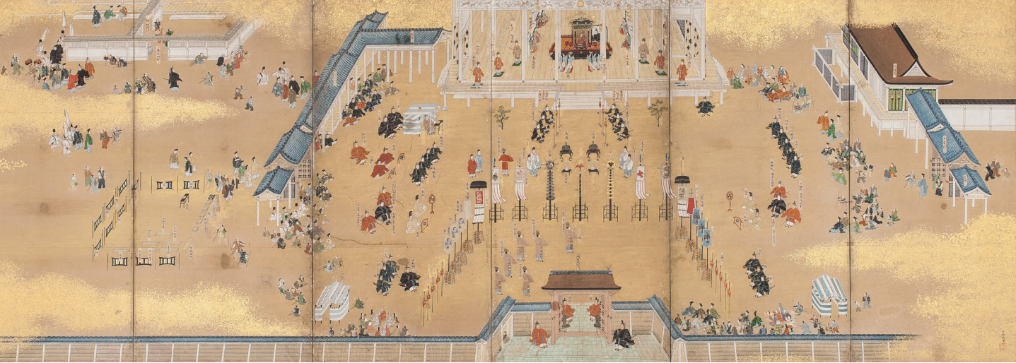
Enthronement of Emperor Reigen, by Kanō Einō, detail