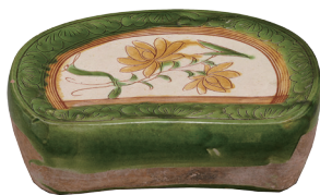
Bean-Shaped Pillow with Peonies Gift of Matsui Hirotsugu, Kyoto National Museum