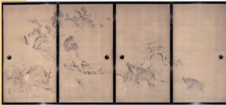
Wild Boars, Deer, and Monkeys in the Snow By Mori Sosen Kōsei-in Temple, Kyoto