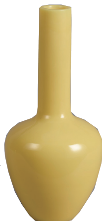
Ovoid Bottle with Long Slender Neck; Qianlong Reign Mark Gift of Matsui Hirotsugu, Kyoto National Museum