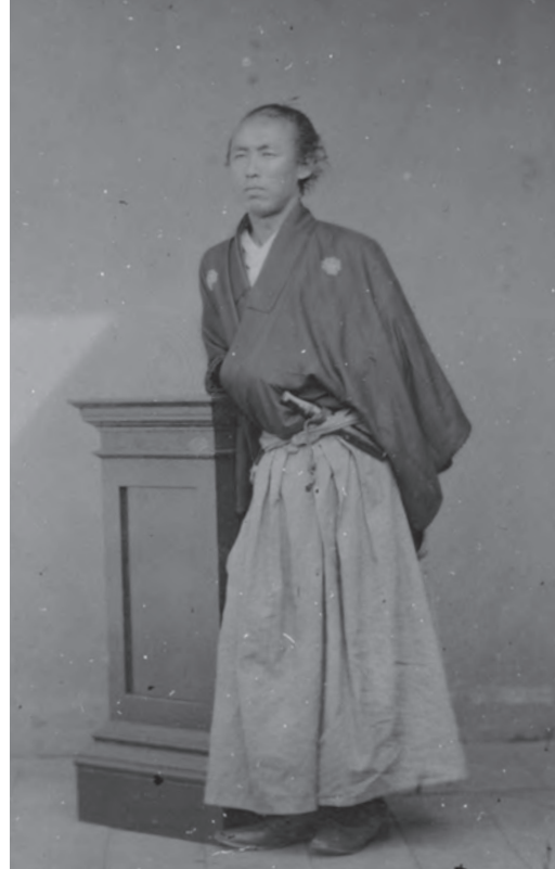
Photograph of Sakamoto Ryōma Kochi Prefectural Museum of History