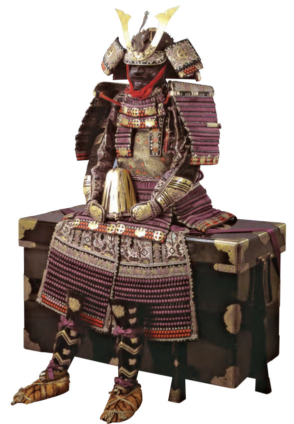
Armor ( Yoroi ) with Purple Lacings Owned by Shimazu Nariakira (1809–1858) Kyoto National Museum