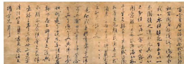
National Treasure Certificate of Advanced Learning in Buddhism By Shunjō (1166–1227) Sennyū-ji Temple, Kyoto

The vast complex of Sennyū-ji in Kyoto's Eastern Hills was founded eight centuries ago by the priest Shunjō (1166–1227). Its name, literally "temple of the bubbling spring," derives from the fresh spring water source within the temple precincts. While Sennyū-ji has long attracted worshippers from all parts of Japanese society, it has especially deep connections with Japan's imperial family, as evidenced by the nickname Mi-tera , or "Imperial Temple." This exhibition highlights calligraphy, painting, sculpture, and other objects from Sennyū-ji that exemplify its long and distinguished history.