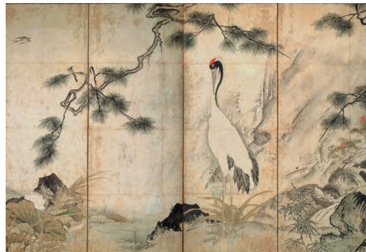
Important Cultural Property Birds and Flowers of the Four Seasons , detail By Sesshū Kyoto National Museum

(By Inami Rintarō, Associate Curator of Illustrated Handscrolls Paintings; translated by Melissa M. Rinne)