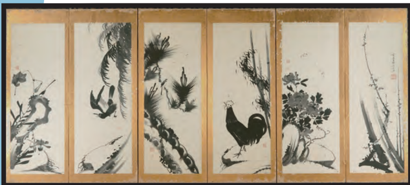
Birds and Flowers of the Four Seasons, left screen By Itō Jakuchū