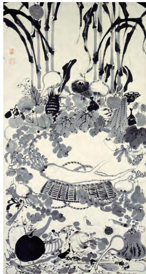
Vegetable Nirvana by Itō Jakuchū Kyoto National Museum