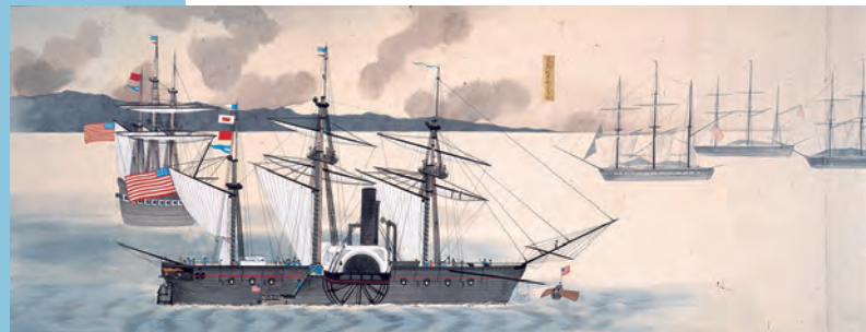
The Arrival of Commodore Matthew Perry's Ships